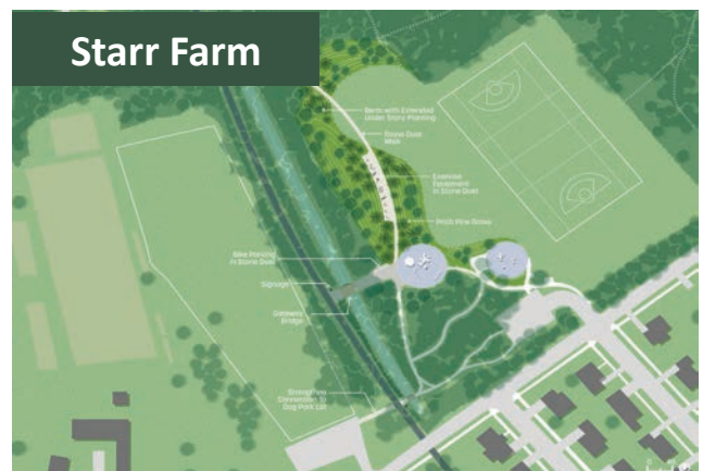
Conceptual designs for the new Pause Places for 2018.