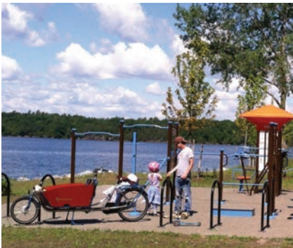
Family enjoys the fitness station together.