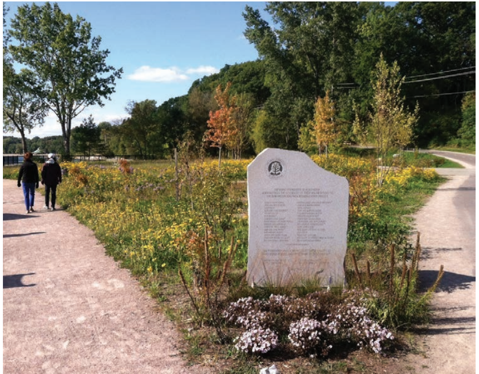
Walkers stroll past the dedication stone honoring major Foundation donors.

The Parks Foundation of Burlington seeks to inspire the spirit of stewardship and philanthropy for our community's treasured parks and recreation assets for our residents and visitors.