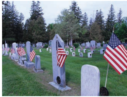
Improvements to Lakeview Cemetery