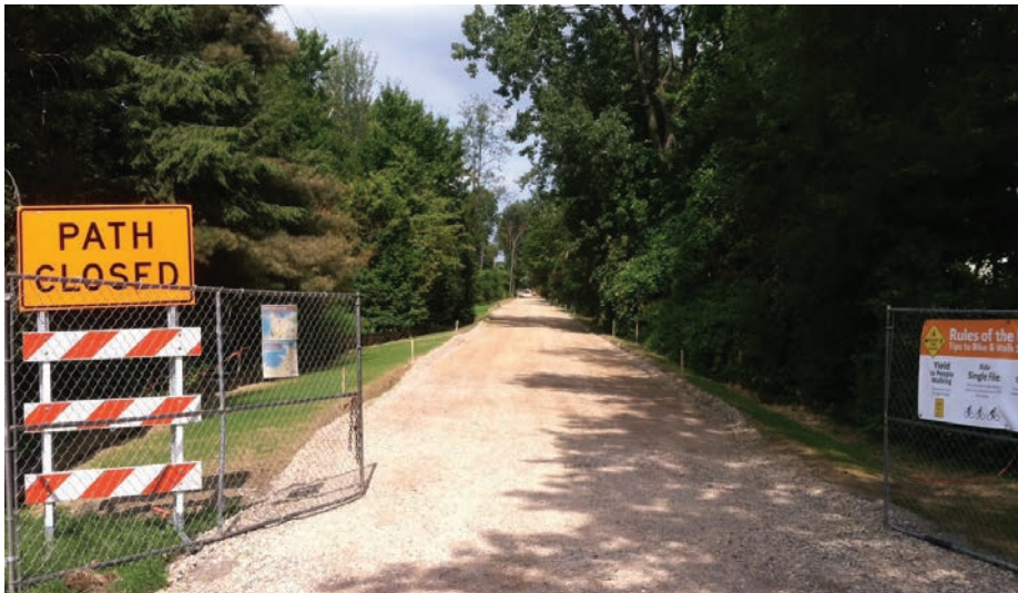
New sub-base almost ready for new pavement.