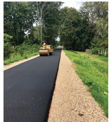
Paving the new 11" wide path.

Merchants Bank Northfield Savings Bank Peoples United Pest Pro, Inc Queen City Ghostwalk Run Vermont Saint John's Club Securities Finance Trust Company Seventh Generation, Inc. The Converse Home Twincraft Skincare United Way of Northwest Vermont University of Vermont Medical Center Westport Hospitality