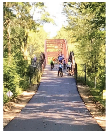
Completed section approaching the Winooski River Bridge.