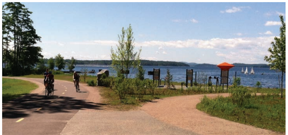
Bike riders enjoy the new scenic views of the realigned path in the Urban Reserve.