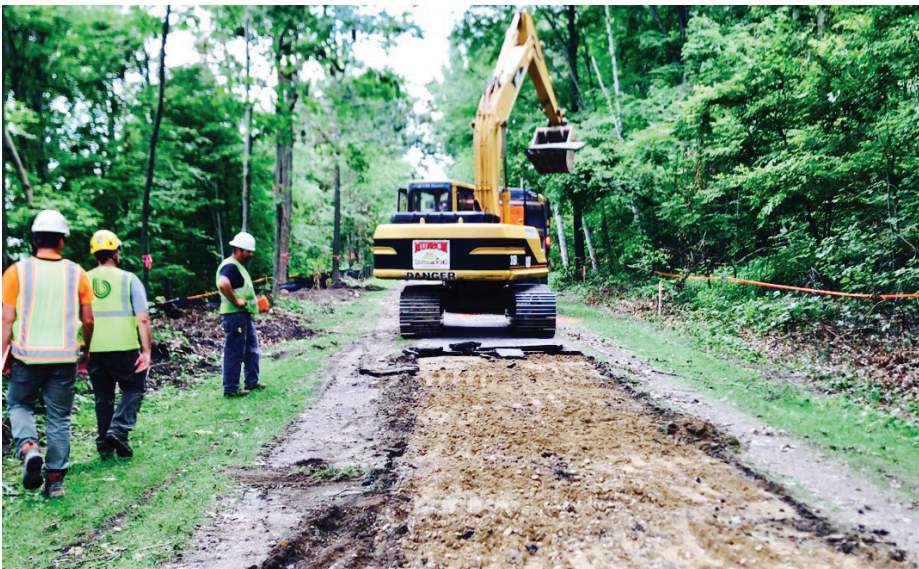
Construction crews remove the old path.