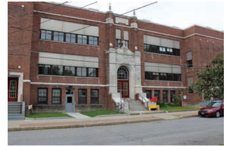
The new home for the Senior Center at the ONE Community Center (formerly St. Joseph School)