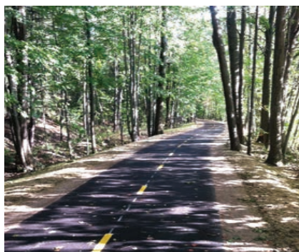
Newly rehabilitated bike path near Starr Farm Rd.