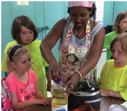
Scholarship funds support youth summer camp programs