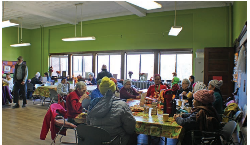
New flooring, paint and other improvements for the new Champlain Senior Center.