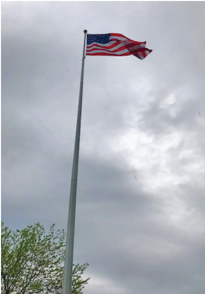
The new 78' tall flagpole at Battery Park