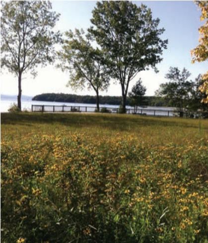
Wildflowers in bloom at the new overlook in the Urban Reserve.

Inspiration for the establishment of a dedicated Parks Foundation comes from many municipalities and states across the country that are successfully increasing awareness of the importance of parks and recreational programming while at the same time attracting philanthropic support.