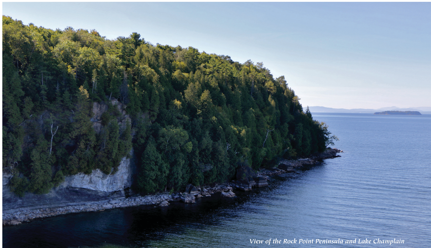
View of the Rock Point Peninsula and Lake Champlain