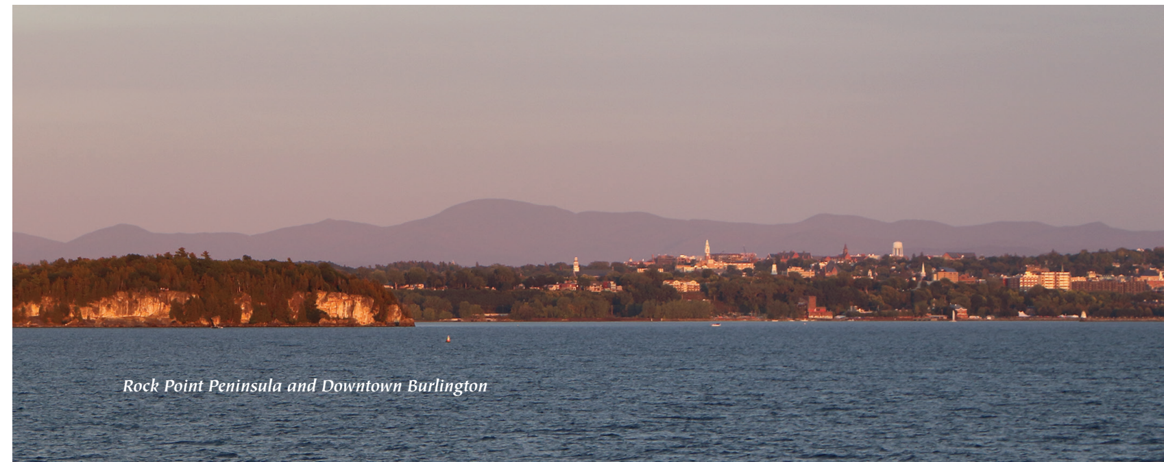
Rock Point Peninsula and Downtown Burlington