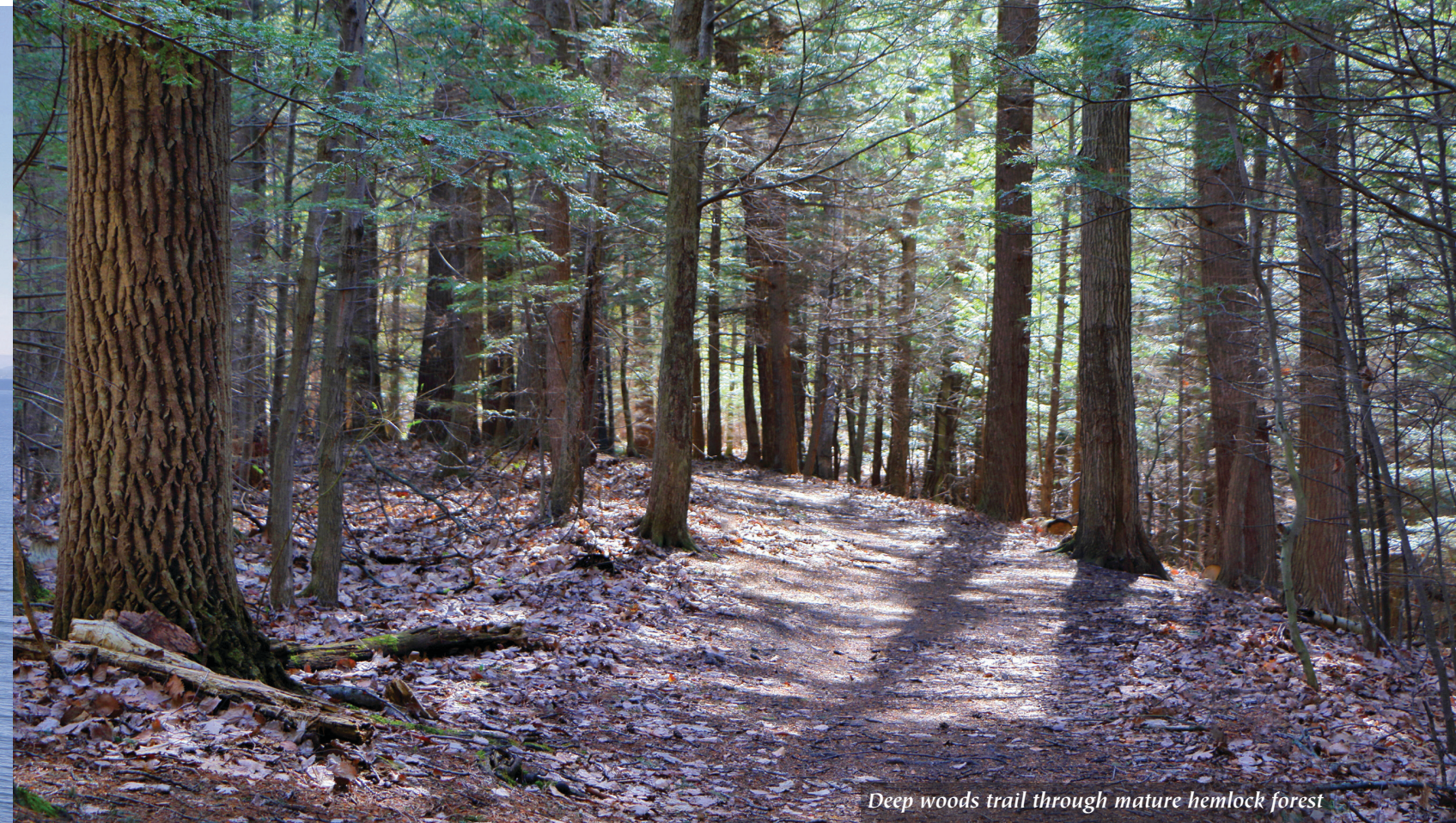
Deep woods trail through mature hemlock forest