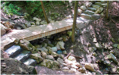
New steps and bridge at the Thrust Fault Trail in Rock Point