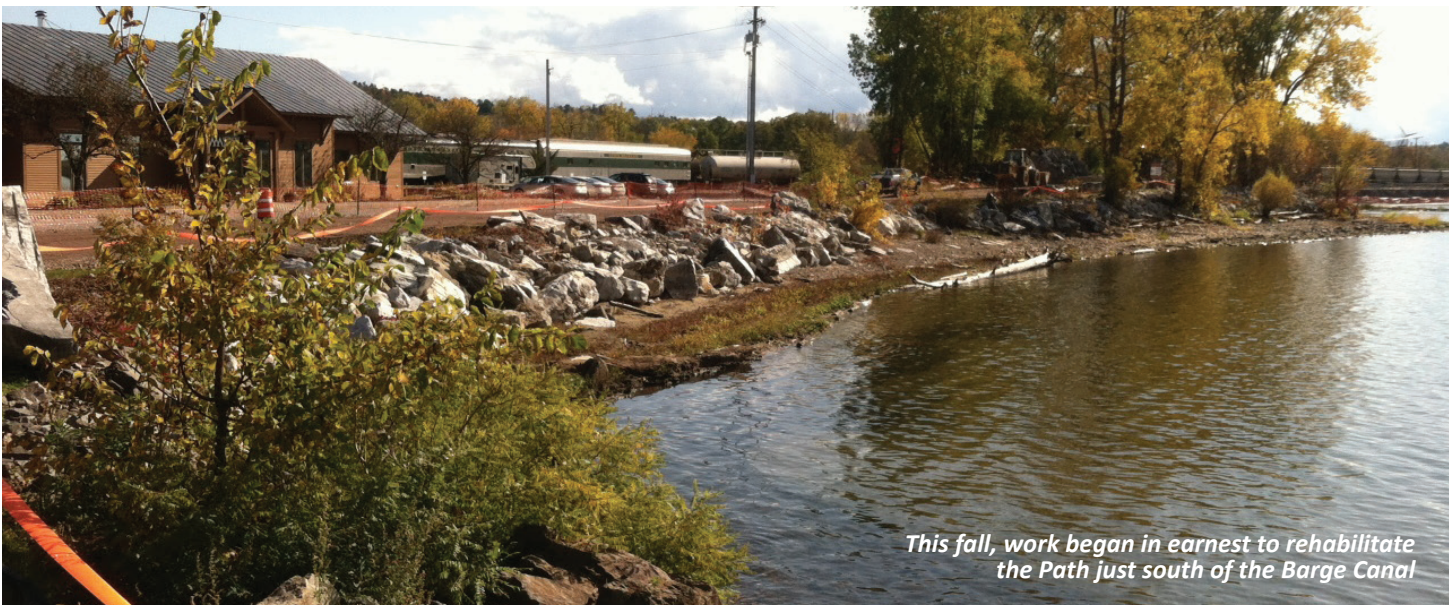
This fall, work began in earnest to rehabilitate the Path just south of the Barge Canal On the cover: Pulpit Rock at Rock Point in winter, and the ground breaking event for the Bike Path Rehabilitation.