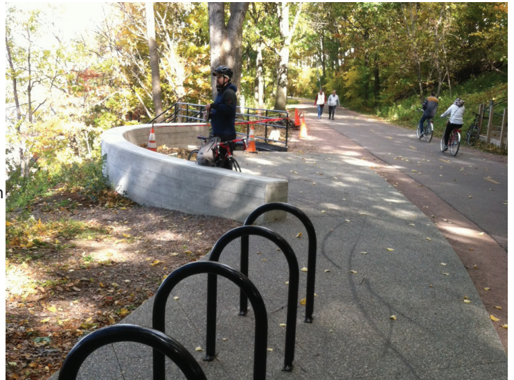
The new North Shore pause place features an overlook and new bike racks

This year the Parks Foundation was proud to partner with the Episcopal Diocese, the Lake Champlain Land Trust, and the Burlington Parks and Recreation Department to preserve the Rock Point peninsula of 180 acres of wilderness and shoreline adjacent to the Bike Path. Work in this conserved area has begun with new trails cut through the Rock Point peninsula for guided public access. Through the use of newly awarded Burlington Conservation Board's Legacy Funds, trails, signage and kiosks with maps will also be developed in the Arms Forest, and throughout Rock Point. The project has been supported by the Rock Point and Arms Forest Coalition Steering Committee.