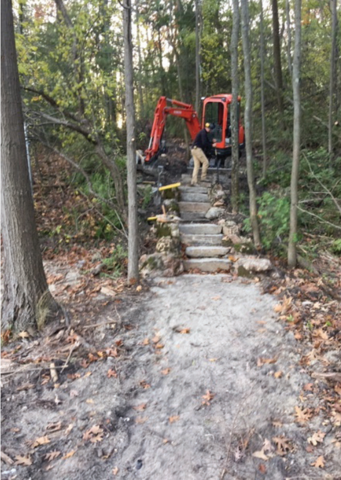
North Beach access trail construction in Rock Point