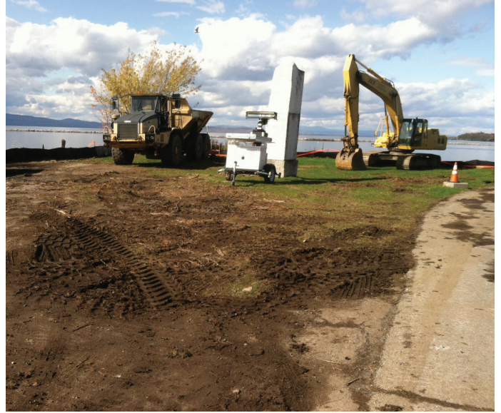
Pause place rehabilitation work between Roundhouse Park and Perkins Pier along the Path