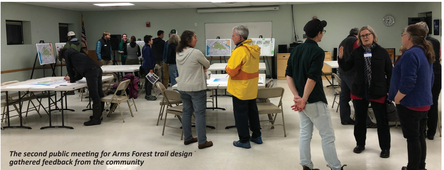
The second public meeting for Arms Forest trail design gathered feedback from the community

* Represents the cumulative amount taken from funds raised to cover administrative cost (Board insurance, Legal, IT software, tax preparation, donor events, supplies). Each year the Board sets a percentage between ½ % and 2%, depending on expected revenues.