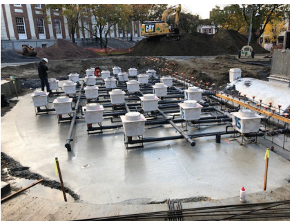
New fountain installed as part of the City Hall Park renovations