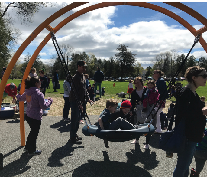
The grand opening celebration for "Oakledge For All" first phase playground equipment installation