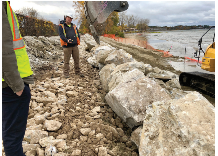
Early fall progress along the Bike Path Rehabilitation project near the Barge Canal