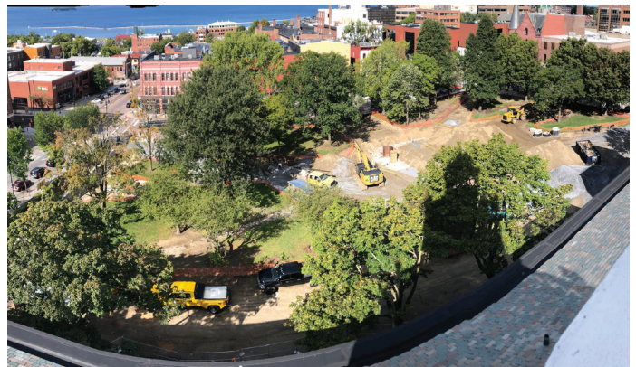
Bird's eye view of Clty Hall Park renovations