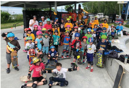
Summer camp kids learn to skate at the A_Dog Skatepark