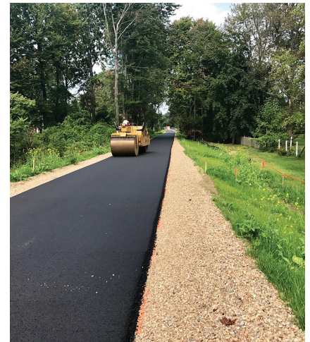
Paving the new 11" wide path.

Merchants Bank Northfield Savings Bank Peoples United Pest Pro, Inc Queen City Ghostwalk Run Vermont Saint John's Club Securities Finance Trust Company Seventh Generation, Inc. The Converse Home Twincraft Skincare United Way of Northwest Vermont University of Vermont Medical Center Westport Hospitality