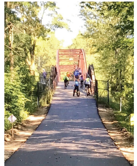
Completed section approaching the Winooski River Bridge.