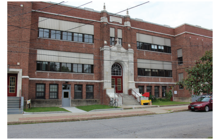
The new home for the Senior Center at the ONE Community Center (formerly St. Joseph School)