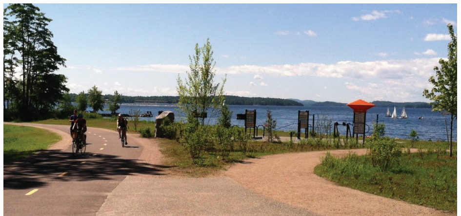
Bike riders enjoy the new scenic views of the realigned path in the Urban Reserve.