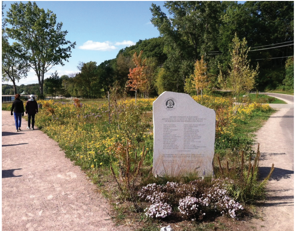
Walkers stroll past the dedication stone honoring major Foundation donors.

The Parks Foundation of Burlington seeks to inspire the spirit of stewardship and philanthropy for our community's treasured parks and recreation assets for our residents and visitors.