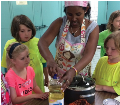
Scholarship funds support youth summer camp programs