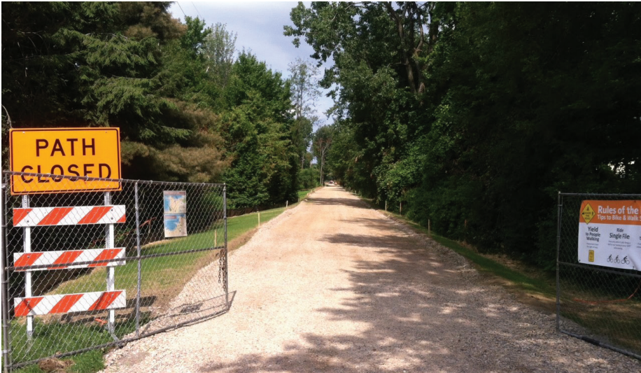
New sub-base almost ready for new pavement.