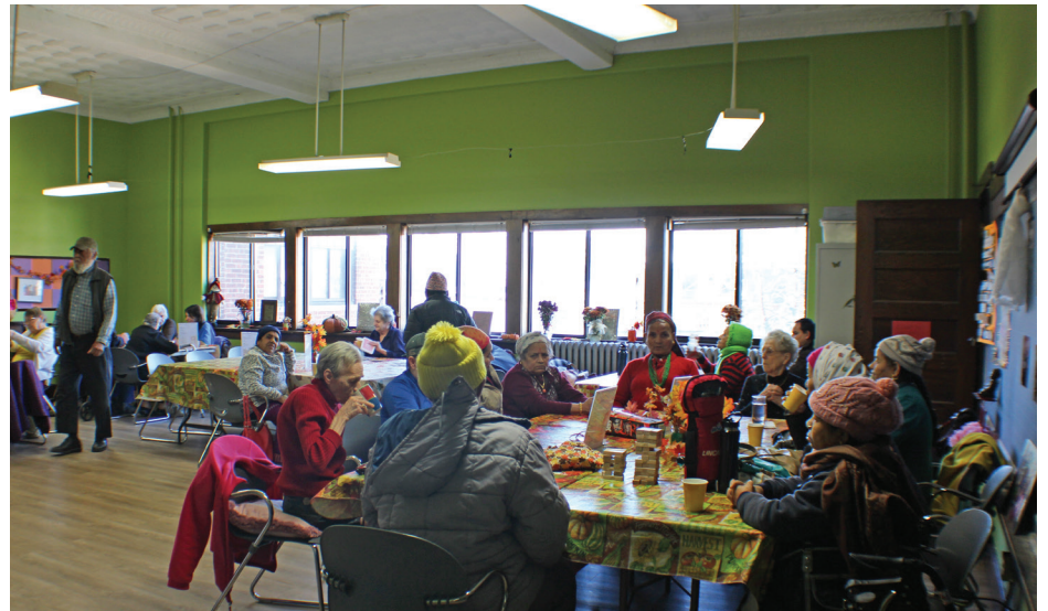
New flooring, paint and other improvements for the new Champlain Senior Center.