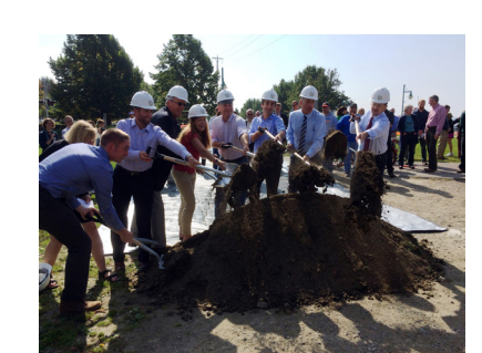
October '14 ground breaking of the Burlington Bike Path rehabilitation.