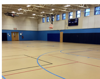
Renovation of the gymnasium floor at the Miller Community Center.