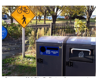
Summer '14 Big Belly trash compactor installation at Waterfront Park.